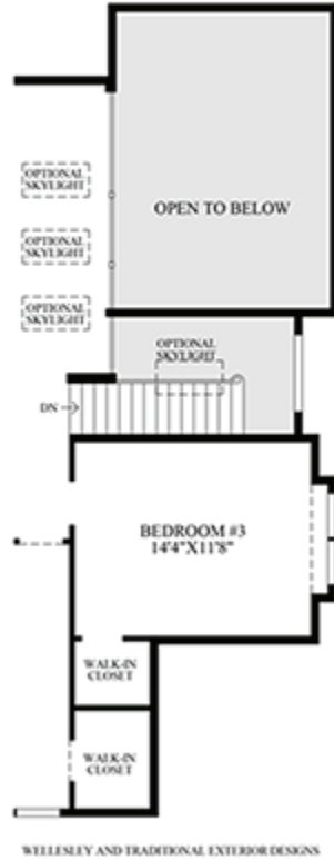
WELLESLEY AND TRADITIONAL EXTERIOR DESIGNS