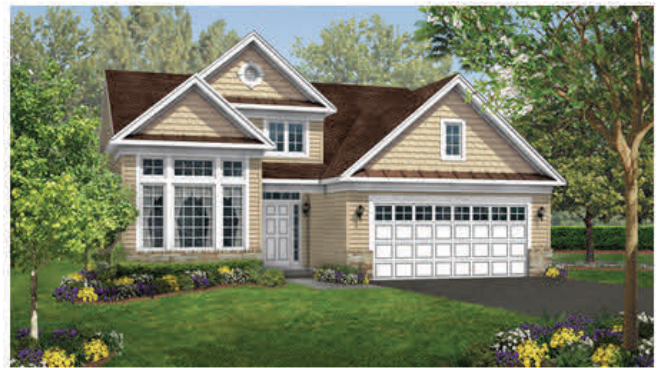
The Eastern Shore